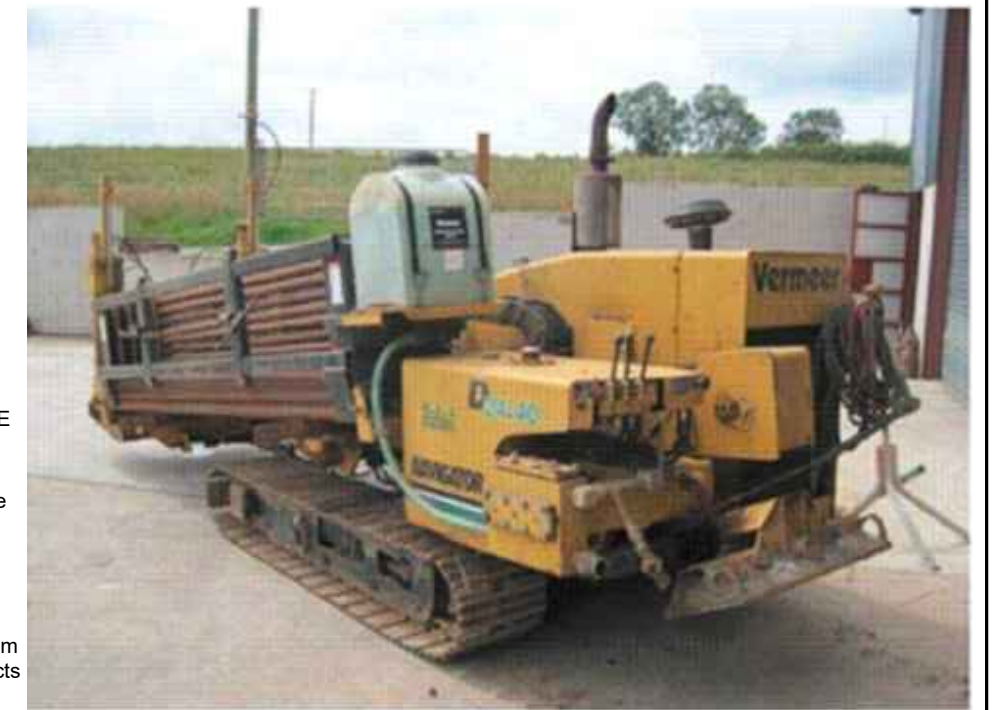
Directional Drilling Rig