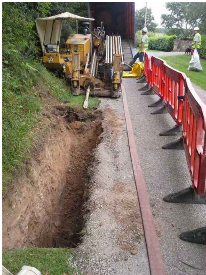
Drilling Rig/Launch Pit