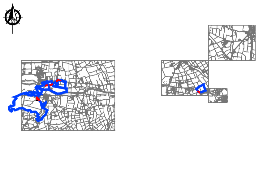
KEY PLAN Scale 1:100000