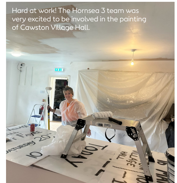
Hard at work! The Hornsea 3 team was very excited to be involved in the painting of Cawston Village Hall.

Over two days the team picked up their brushes, put on their overalls and helped to transform the space with a fresh coat of paint. We hope that this renovation enhances the community's use of the hall and we look forward to using the space ourselves for stakeholder meetings and activities in the future.