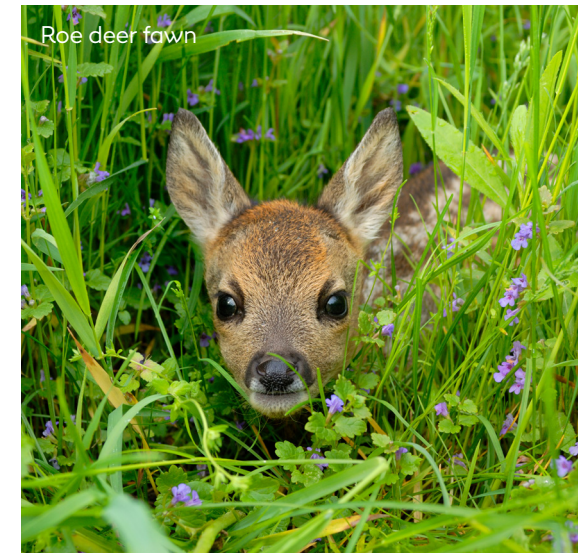
Roe deer fawn

Other animal species we have spotted include otters, water voles, slow worms, grass snakes, white-clawed crayfish, great crested newts, common lizards, and several bat species. Additionally, numerous badger setts have been found and are safeguarded under the Protection of Badgers Act.