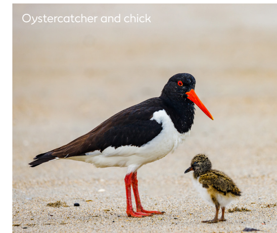
Oystercatcher and chick

Some of the birdlife seen on-site includes barn owls, red kites, and little ringed plovers, all of which are nesting and are protected. Other protected birds observed include the marsh harrier, hobby, and kingfisher. Additionally, we have encountered various nesting birds near to where we are working such as blue tits, skylarks, and oystercatchers.