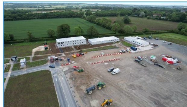
OnCS Equipment & Machinery Storage Area