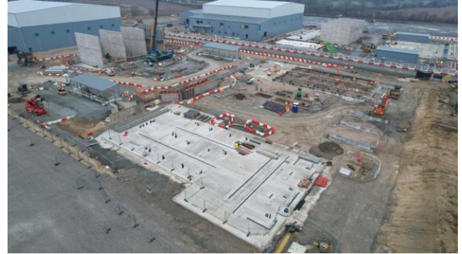
AC Yard & Cable Pits

*Please note that these timings are subject to change.