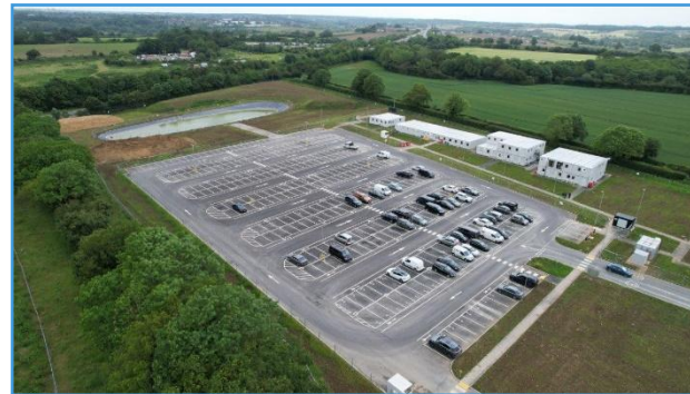
OnCS Car Park

*Please note that these timings are subject to change.