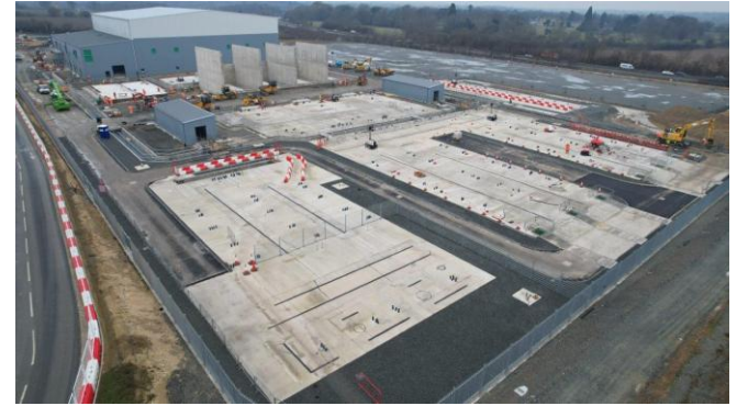
AC Yard, Cable Pits & Duct Installation

*Please note that these timings are subject to change.