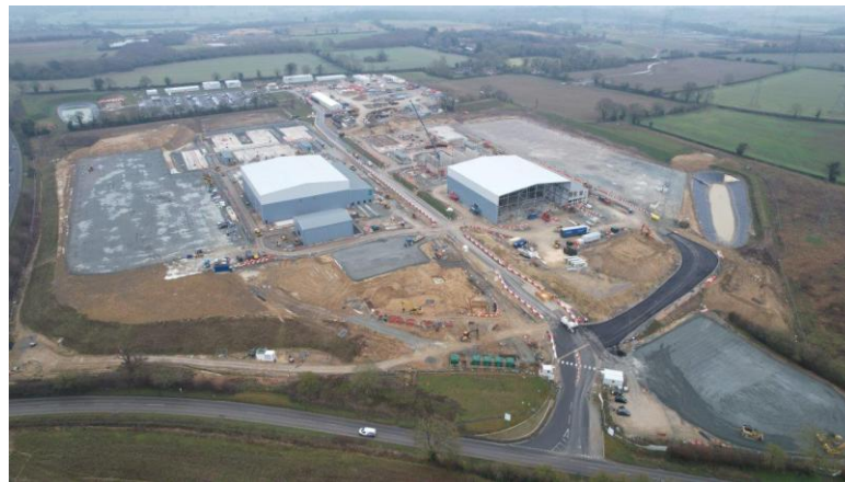
OnCS site entrance as completed

*Please note that these timings are subject to change.