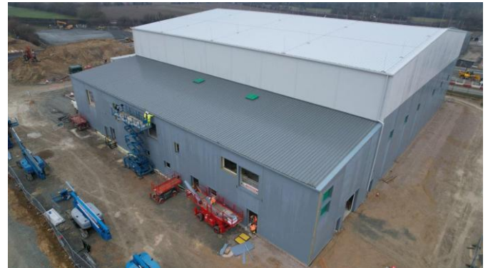
Link 2: Valve Hall & Service Building