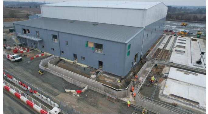
Link 1: Valve Hall & Service Building

*Please note that these timings are subject to change.