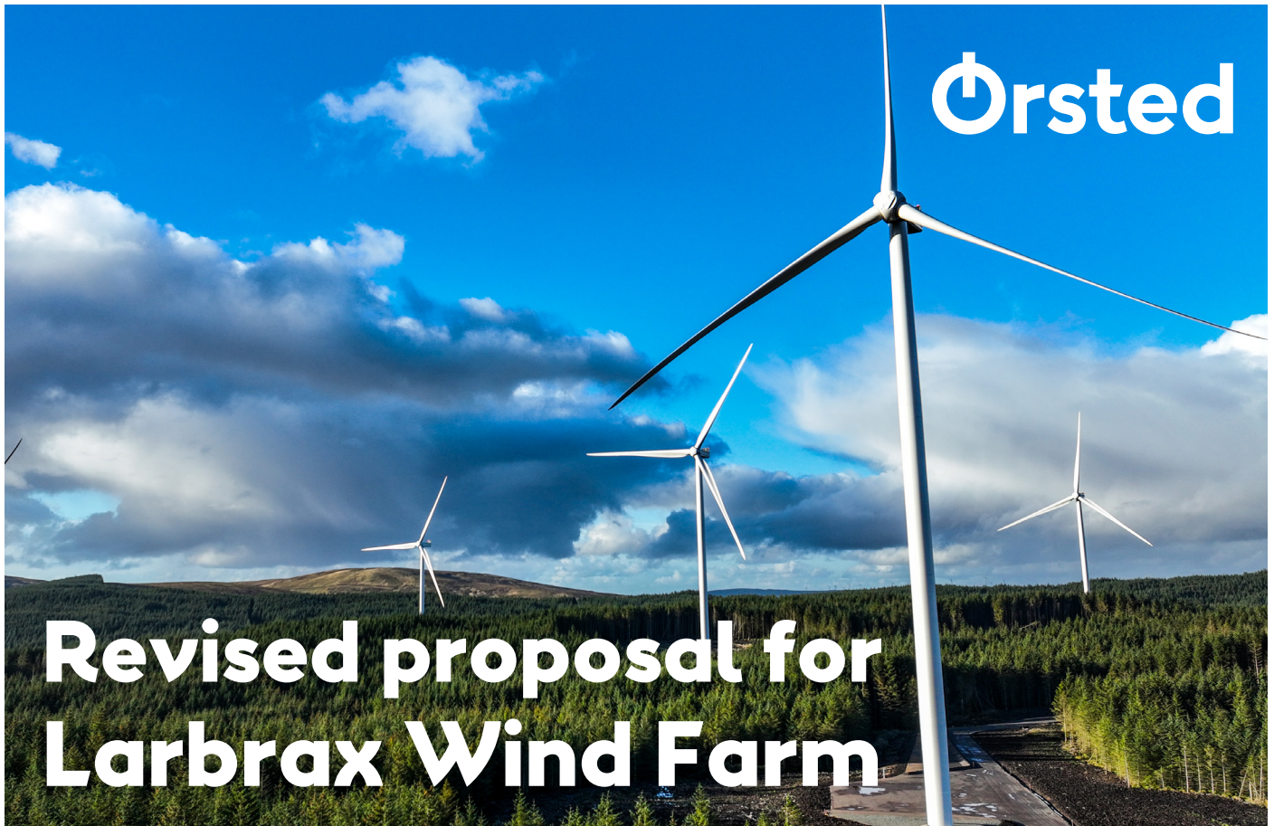
Kennoxhead Wind Farm, South Lanarkshire

In November 2023, we consulted with the community on our proposals for the revised Larbrax Wind Farm, on the North Rhins Peninsula in Wigtownshire. As a result of the feedback we received, our design team has further refined these proposals. We have been working to create a wind farm design that reduces impact on peatland, forestry, transport, landscape and potential visual impact, from previous proposals consulted upon.