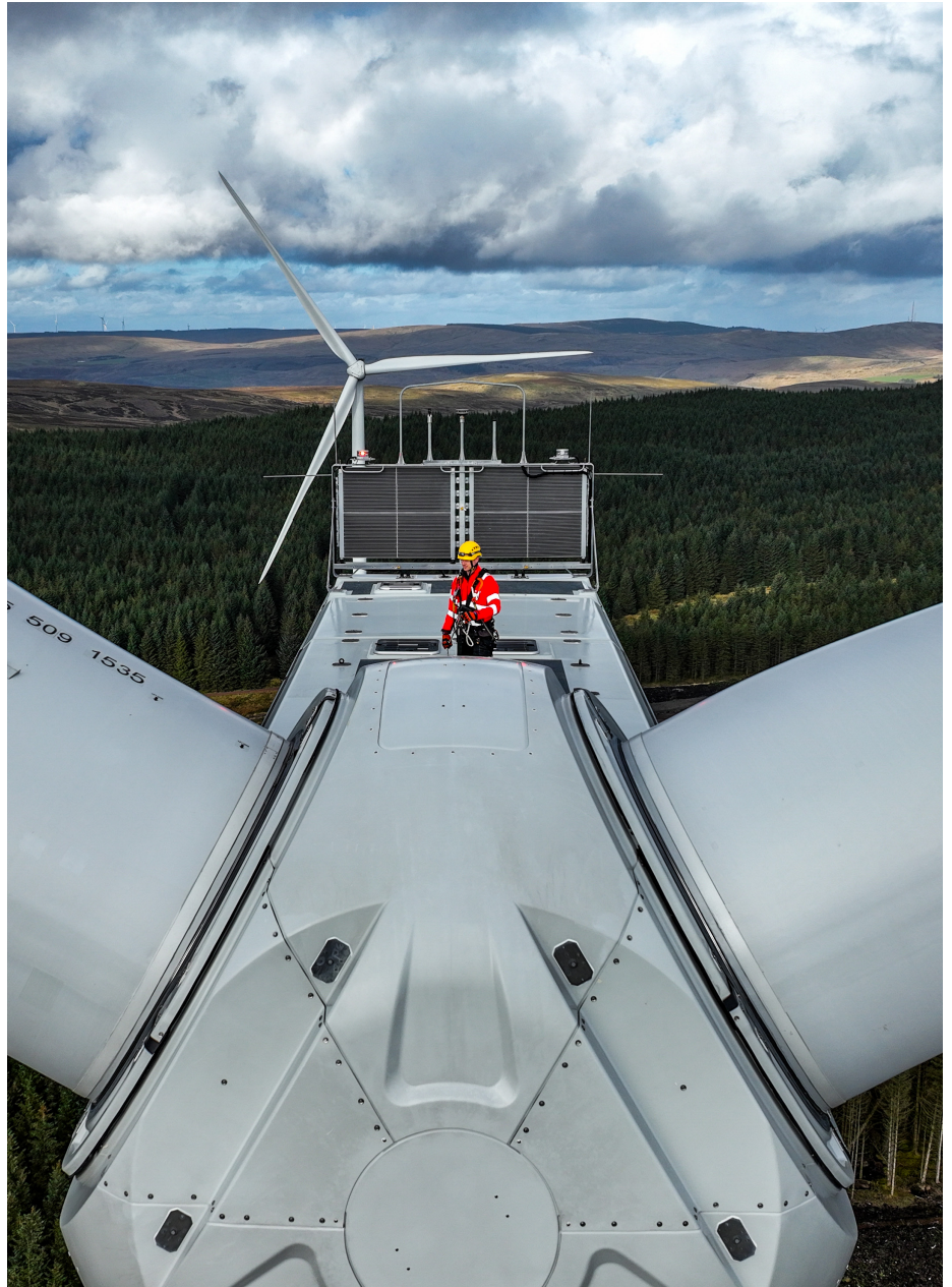
Kennoxhead Wind Farm, South Lanarkshire

Onshore wind is an unlimited and renewable source of clean energy and will play a vital role in meeting ambitious net-zero targets set out by the UK and Scottish governments while helping to realise the global shift to green energy.